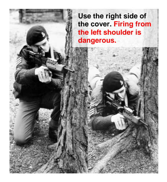
No matter how cover is used, the four marksmanship principles are to be applied.