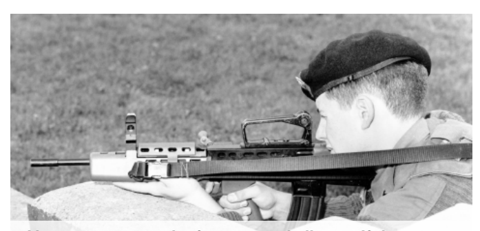
Always try to rest the forearm and elbows. If the forearm cannot be supported, rest the back of the hand on the cover. Failing that, rest the hand guard on the cover, keeping the hand as close to it as possible.